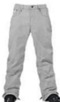
Pistol Pant $179.95 - $194.95