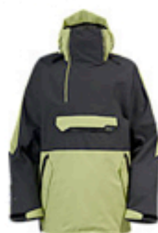
2L Anorak Jacket $349.95