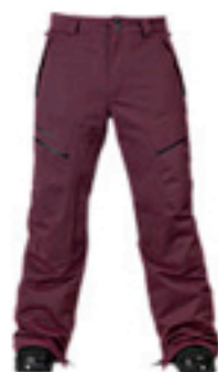
Freemont Pant $189.95