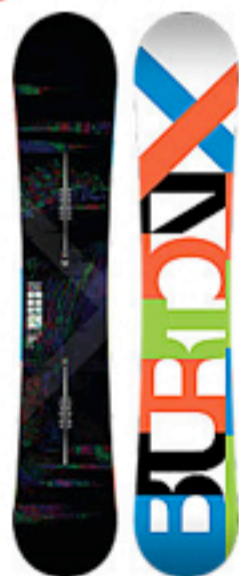
Custom X Snowboard $649.95