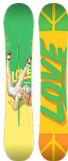
Love Snowboard $499.95