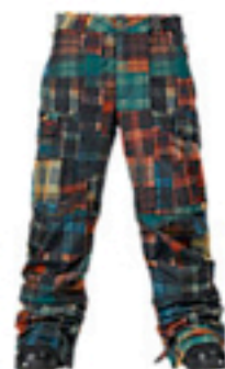
Gungeon Pant $179.95 - $194.95