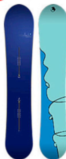
Malolo Snowboard $579.95