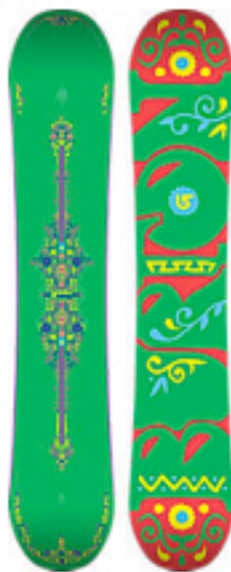
Déjà Vu V-Rocker Snowboard $399.95