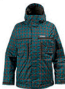
Bit-O-Heaven Jacket $189.95 - $204.95