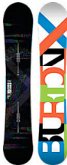
Custom X Snowboard $649.95