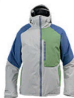
2L Turbine Jacket $379.95 - $394.95