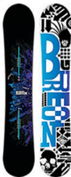
Pro Snowboard $529.95