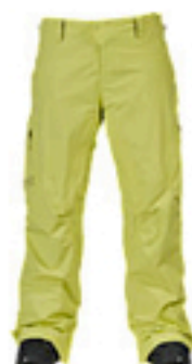
Women's 2L Summit