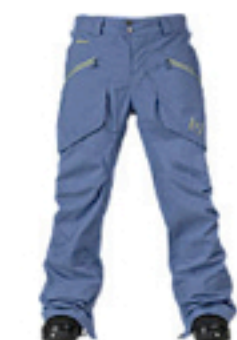
3L Hover Pant $399.95 - $449.95