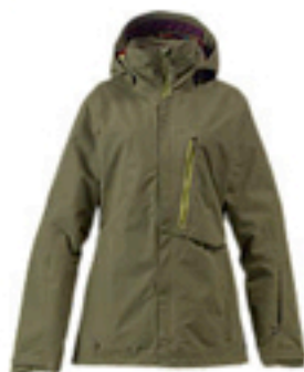
Women's 2L Altitude Jacket $369.95 - $384.95