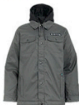
Cholo Jacket $199.95