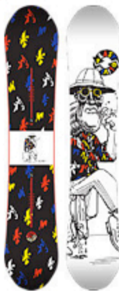
Easy Livin Flying V Snowboard $529.95