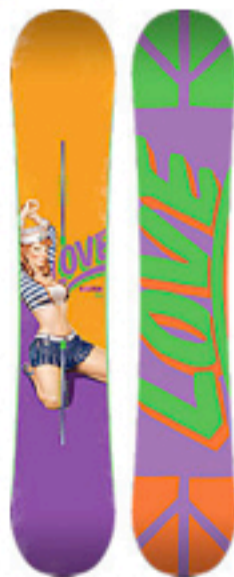
Love Snowboard $499.95