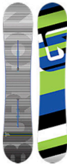
Sherlock Snowboard $489.95