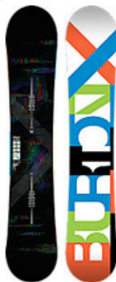
Custom X Snowboard $649.95