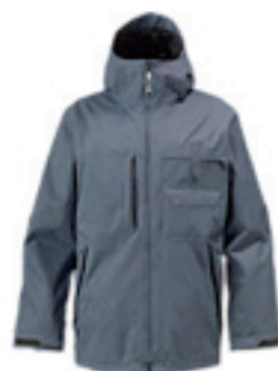
Freemont Jacket $229.95 - $244.95