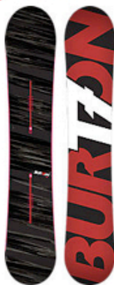
T7 Snowboard $799.95