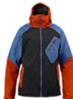
2L Cyclic Jacket $339.95 - $354.95