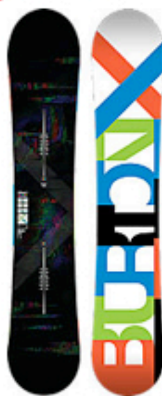
Custom X Snowboard $649.95