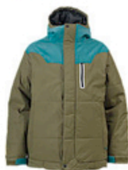
Durban Jacket $279.95