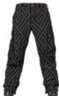
Indecent Exposure Pant $169.95 - $184.95