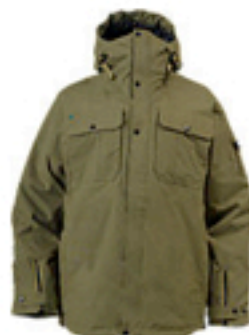
Crucible Jacket $249.95 - $264.95