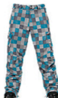
Cargo Pant $149.95 - $164.95