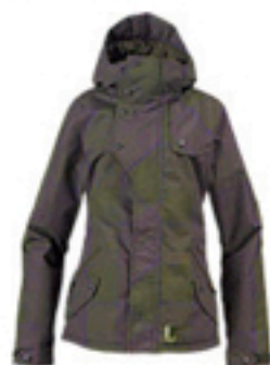
Women's Delirium Jacket $259.95