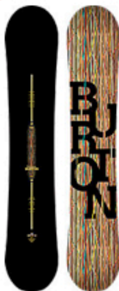
Vapor Snowboard $1,199.95