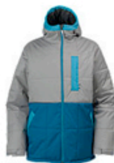
Ante Up Puffy Jacket $219.95