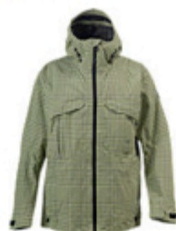
3L Burn Jacket $559.95 - $609.95