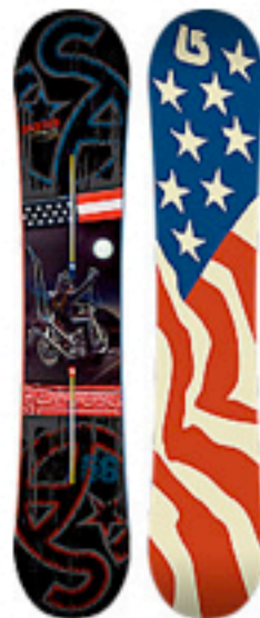
Jeremy Jones Snowboard $449.95