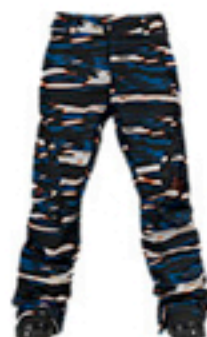
2L Stagger Pant $319.95 - $369.95