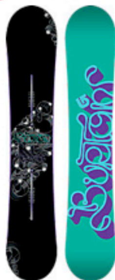
Feelgood Snowboard $529.95