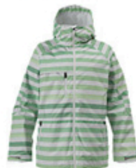
Launch Jacket $169.95 - $184.95