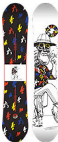
Easy Livin Flying V Snowboard $529.95