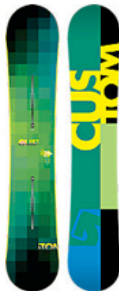
Custom Flying V Snowboard $529.95