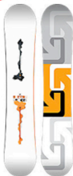
Process Snowboard $399.95