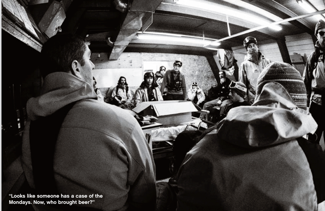
"Looks like someone has a case of the Mondays. Now, who brought beer?"