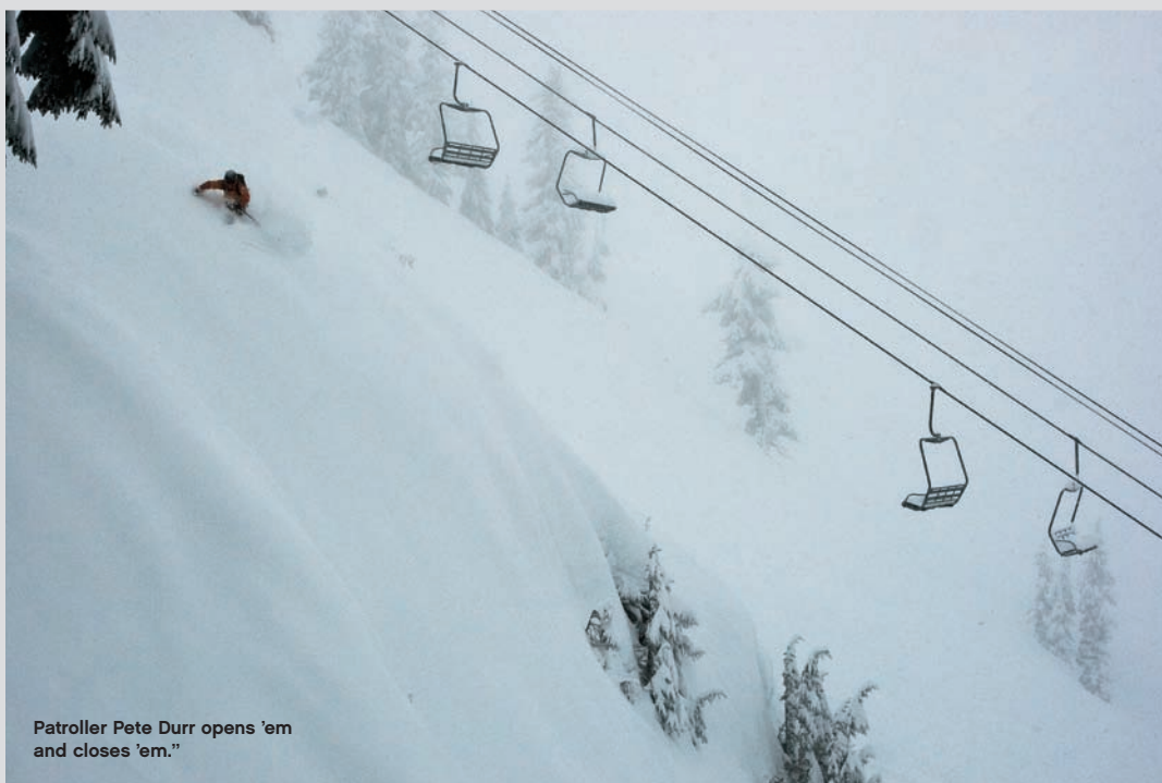
Patroller Pete Durr opens 'em and closes 'em."