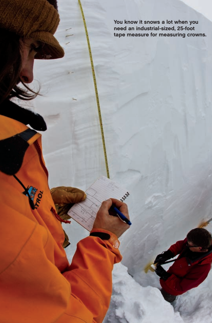
You know it snows a lot when you need an industrial-sized, 25-foot tape measure for measuring crowns.