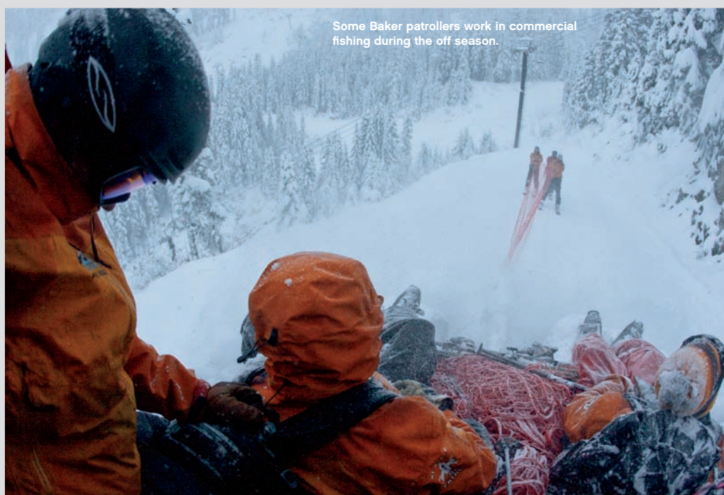
Some Baker patrollers work in commercial fishing during the off season.

BUT ALSO AS A WARNING OF THE RISK THAT THEY WORK TO MITIGATE.