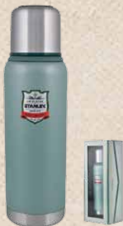
Heritage - 10-00614-000 Case Pack - 4