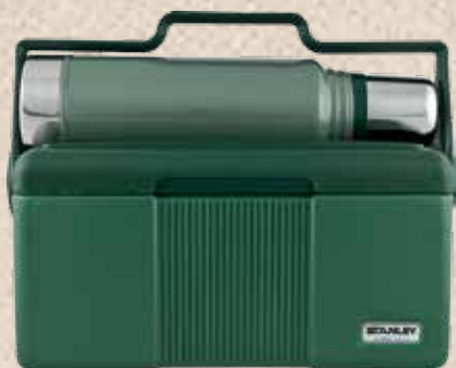
Green - 10-00725-000 Case Pack - 2