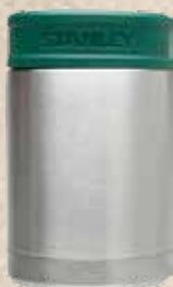
10-01195-001 Case pack- 4