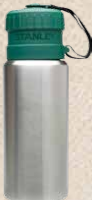
10-01188-001 Case pack- 4