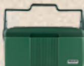
Green - 10-00726-000 Case Pack - 2