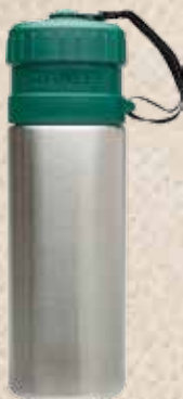
10-01194-001 Case pack- 4