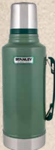
Hammertone - ABT6007-600 Case Pack - 6