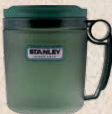
Green - 10-00631-001 Case Pack - 4