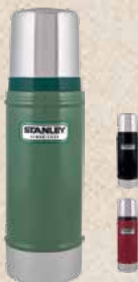
Hammertone - 10-00055-013 Red - 10-00055-019 Black - 10-00055-020 Assorted - 10-00055-026 Case Pack - 4