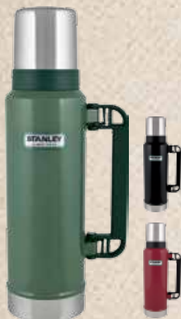
Hammertone - 10-01032-001 Red - 10-01032-002 Black - 10-01032-003 Case Pack - 4