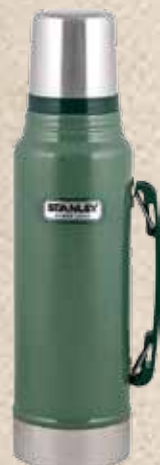
Hammertone - 10-01254-001 Case Pack - 4 6 unit PDQ - 10-01254-003 PDQ 36 unit Floor Display - 10-01254-004 36 unit Floor Display with 24 1.1 Qt Bottles + 12 Food Jars - 10-01264-001