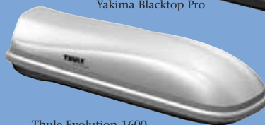
Thule Evolution 1600

Check out our wide selection of cargo boxes and car racks from these name brands