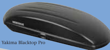
Yakima Blacktop Pro