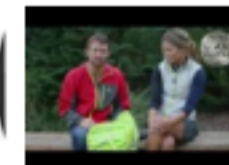
ALCHEMIST 40L BACKPACK - 2012 GEAR OF THE YEAR