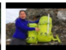
ALCHEMIST 40L PACK - 2012 OUTSIDE GEAR OF THE YEAR