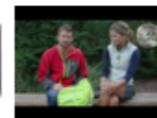
ALCHEMIST 40L BACKPACK - 2012 GEAR OF THE YEAR