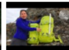
ALCHEMIST 40L PACK - 2012 OUTSIDE GEAR OF THE YEAR