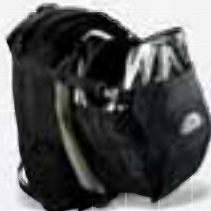
Full Face Helmet Pocket