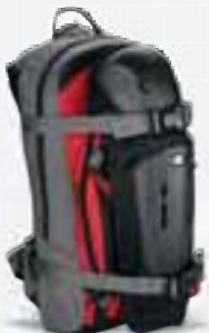
Load compression/gear straps