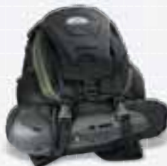
Extra Gear / Armor Straps